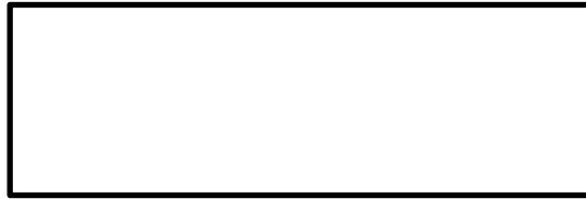
Figure 1: Name of Picture

Source: Author’s Last name OR Organization’s name (Year, Page number OR Online) Khoman (2017, p. 137)